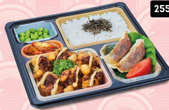
2551 Japanese Garlic Chicken Karaage Bento $10.9

Garlic chicken karaage, 2pcs grilled chicken gyoza, lettuce, tomato wedge, edamame, kimchi, rice with shredded nori.