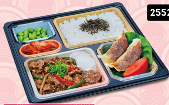
2552 Japanese Beef Yakiniku Bento $12.9

Enjoy ICHIKOKUDO's specialty in your bento box, full of the hearty taste of Hokkaido. Our famous chicken karaage, teriyaki salmon, and beef yakiniku in a bento carefully prepared just for you.